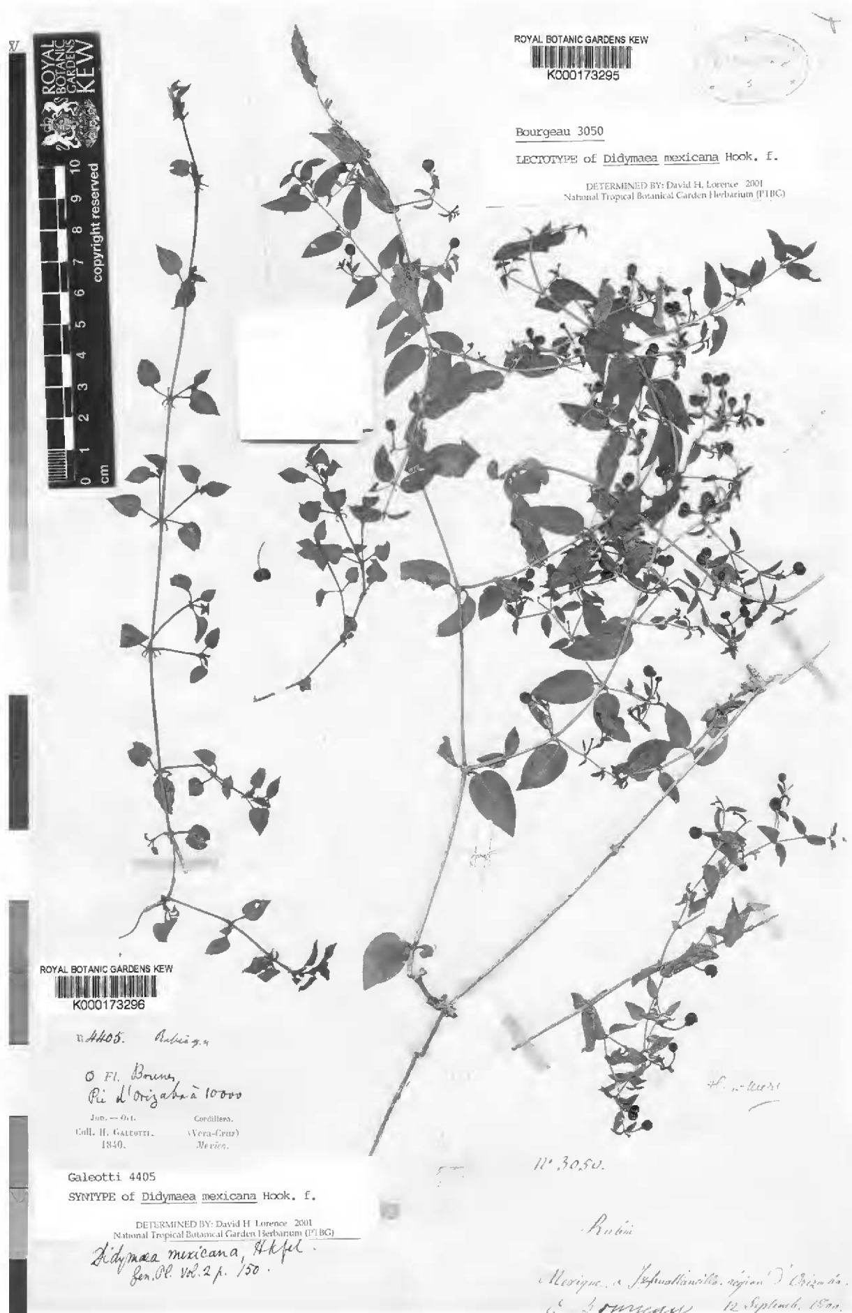
Fig. 2. Lectotype of Didymaea mexicana Hook. f. (right hand collection, Bourgeau 3050, K).